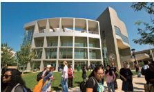
Cleveland State University

These universities grant academic credit to students who are enrolled at them.