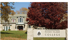
Rhode Island College