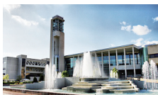
Missouri State University