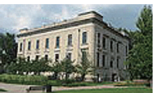
Indiana State University