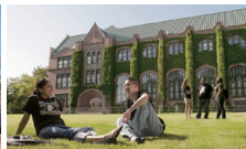
University of Idaho