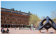
Western Washington University

These universities grant academic credit to students enrolled at them and can also grant transfer academic credit to students from other colleges who apply to the KCP program through them.