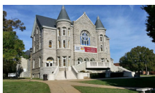
Virginia Union University