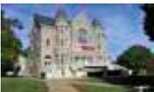
Virginia Union University