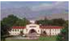
New Mexico State University