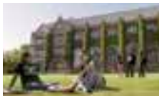
University of Idaho