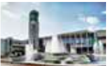
Missouri State University