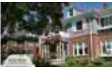
Idaho State University