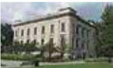
Indiana State University