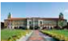
Texas Tech University