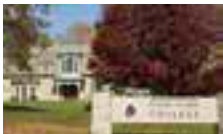
Rhode Island College